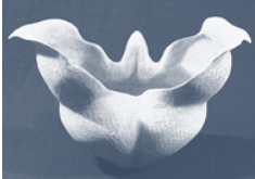
The Language of Craft, Canadian Craft Museum Rachelle Chinnery, Read My Night , 2000.

The centre for the presentation, interpretation, and preservation of Canadian and international cinema offers an alternative to commercial movie theatres. The cinema operates in a City-owned building, rent-free.