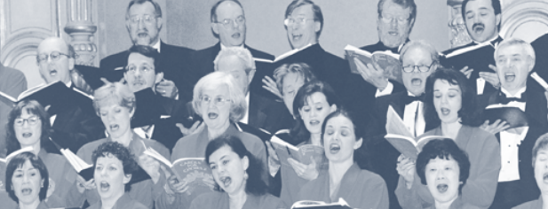
Members of the Vancouver Bach Choir.

Toward the final component of Outrageous Acts: Resisting Globalization , a full-length play developed out of a series of community theatre workshops with women from diverse cultural backgrounds.