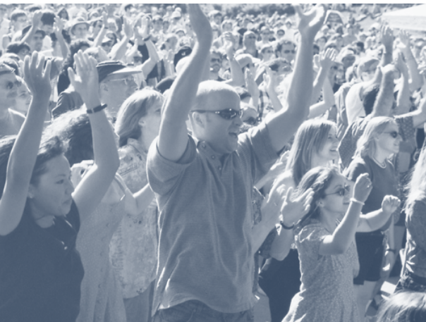
Vancouver's International Jazz Festival Jazz at the Roundhouse at David Lam Park