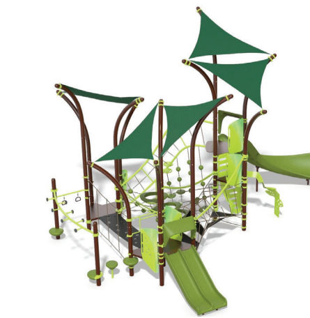
8 TREETOP CLIMBER Play structure for older kids