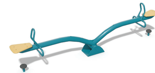
6 SEE SAW Co-play activity