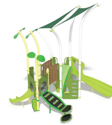
3 SPRIG CLIMBER Play structure for younger kids