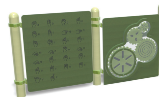
4 PLAY PANELS Activity or educational panels