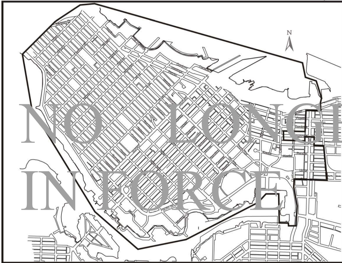
Mount Pleasant Industrial Area