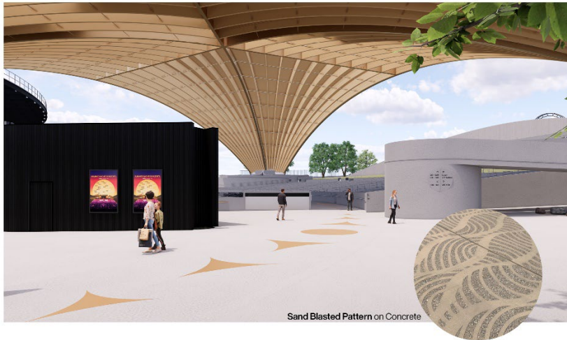
OPPORTUNITY 1 MIDDLE CROSS AISLE - PATTERN ON CONCRETE