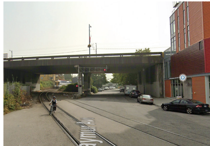
Existing conditions looking south on Raymur Ave across the Burrard Inlet rail line and under the Hastings Overpass.

This will help to reduce the noise from the rail bell warning system and improve local resident livability. The E. Cordova St crossing currently meets the Federal Regulations and no changes are proposed for the crossing at this time; closure to motor vehicles may be considered in the future. The Raymur crossing closure would be implemented by Summer/Fall 2021.