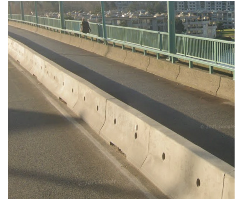
Example of the concrete barriers which will be used to restrict access across the railway on Raymur Avenue.