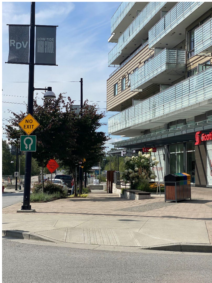
Location B East of River District Crossing