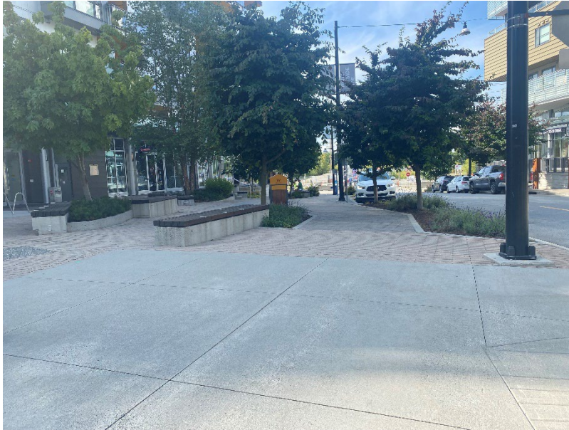
Location A East of River District Crossing