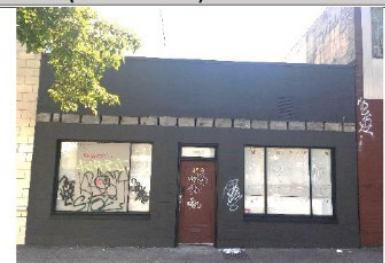
After (Winter 2022)