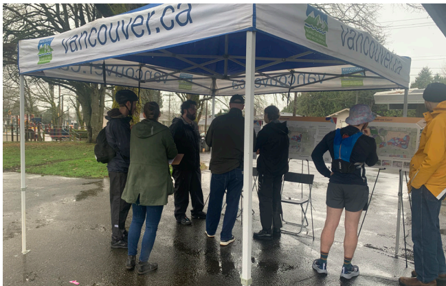
March 29, 2025 - Pop-up at Slocan Park

This report summarizes the feedback we received on the proposed concept during the public information sessions held at Slocan Park on March 29 and Renfrew Community Centre on April 8.