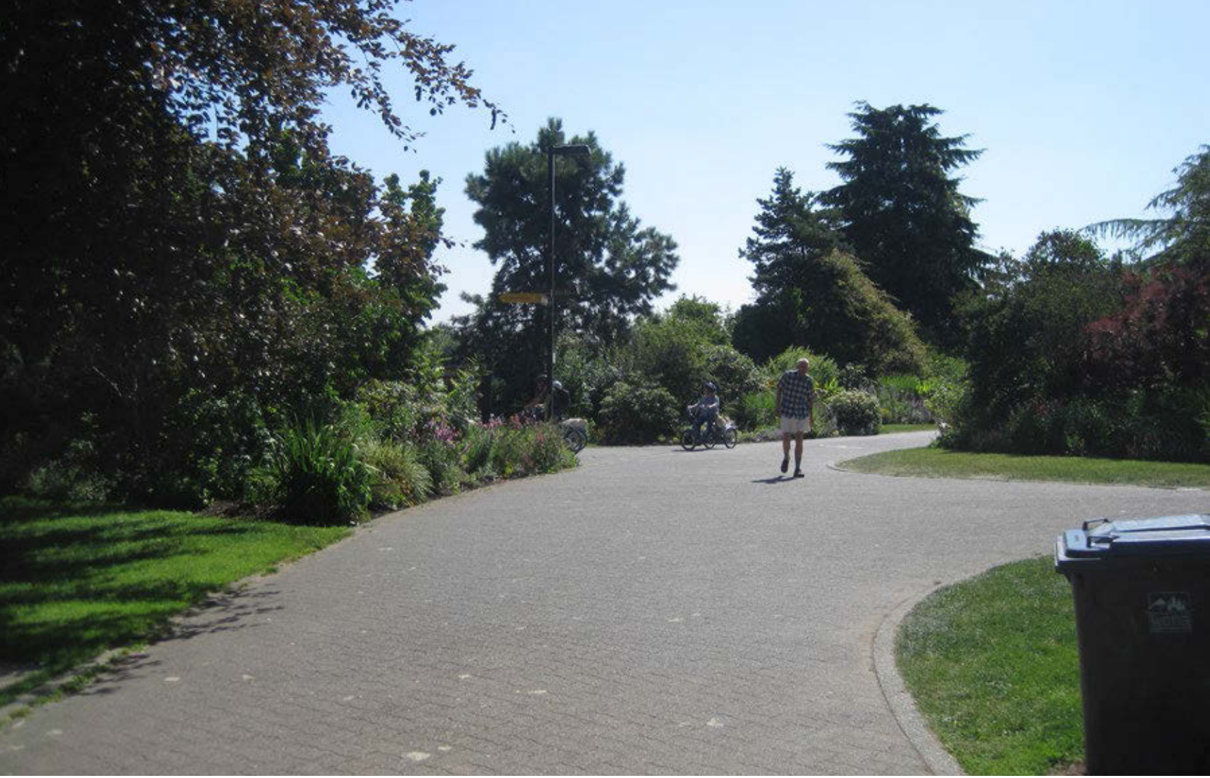
Existing view, Island Park Walk and Shore Pine Walk looking East

Widen pathway and provide painted separation and signage to clearly mark walking and cycling paths.