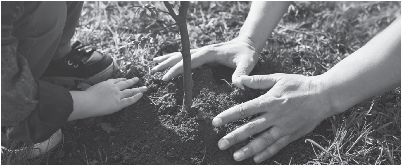
Fig 2: Lightly but firmly tamp the backfilled soil up to the root flare, without burying the trunk.