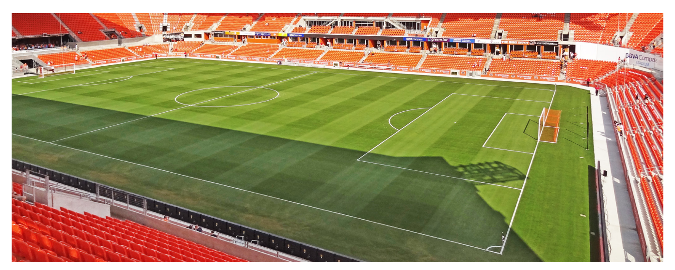
Professional soccer natural turf field, PNC Stadium, Houston, Texas.