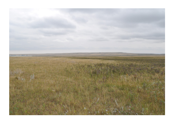
Meadow/Prairie - Hand Hills Ecological Res