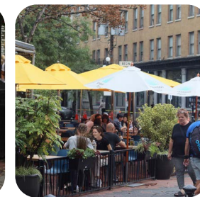
Dedicated space to support businesses' patios and merchandise displays