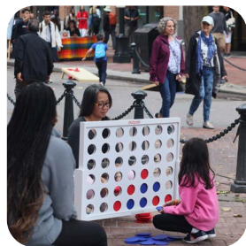
Flexible open space with movable furniture for community programming and events