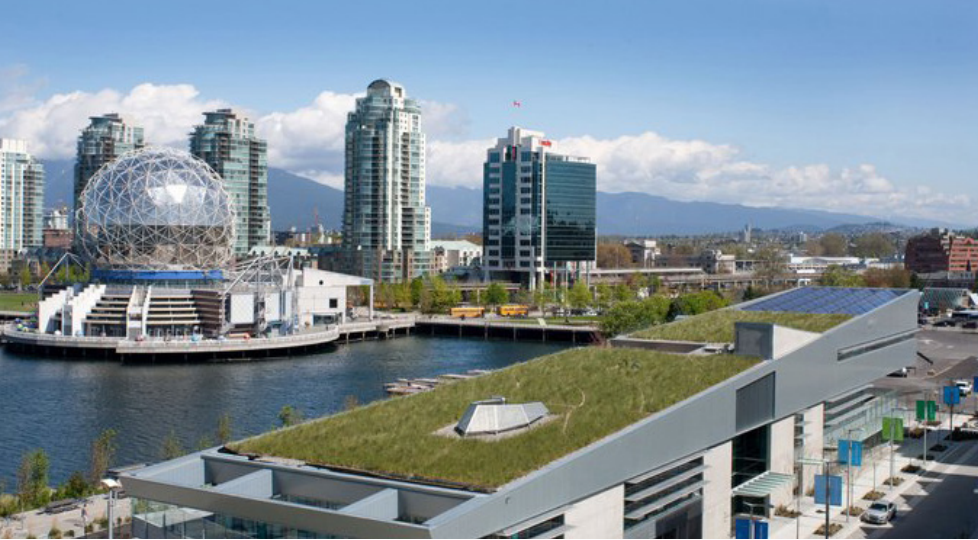
Creekside Community Centre, Vancouver, BC City of Vancouver