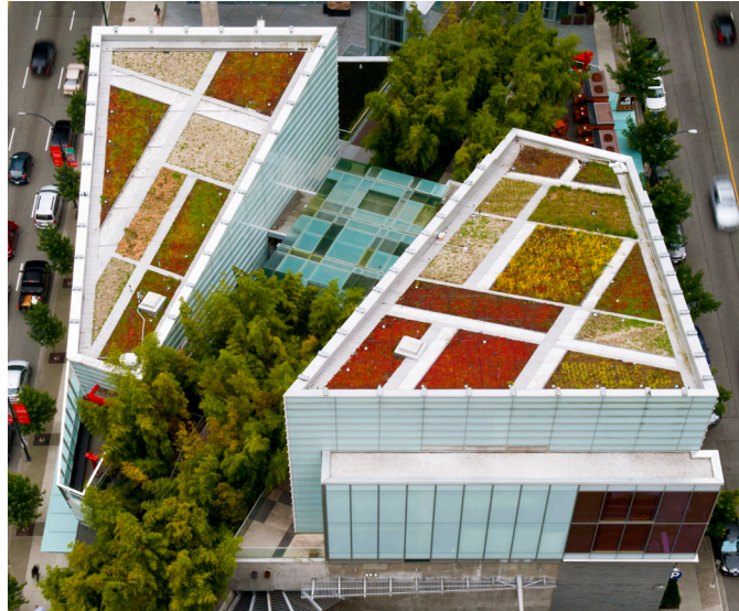
Shangri-La Mixed-Use Building, Vancouver, BC PFS Studio