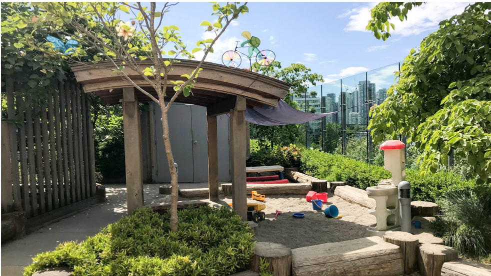
Creekside Community Centre Rooftop Childcare, Vancouver, BC