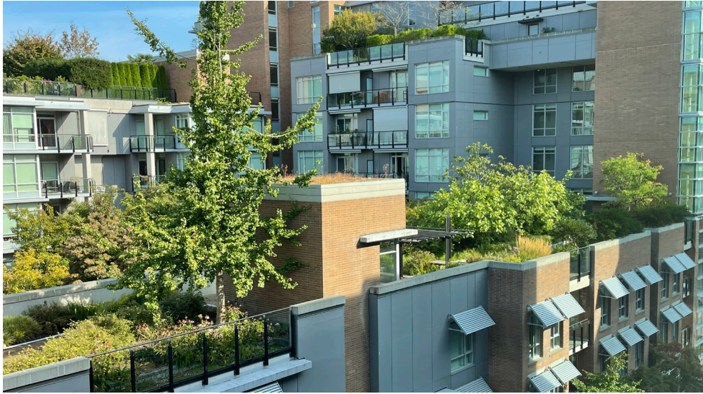
Private Condo Amenity, Vancouver, BC

PWL Partnership Landscape Architect Inc.