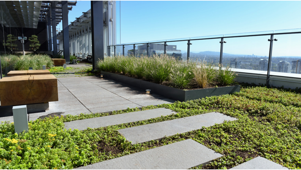
Telus Garden, Vancouver, BC Henriquez Partners Architects + PFS Studio