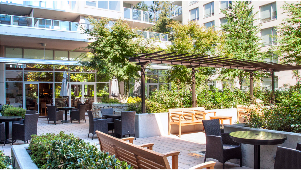
UBC Seniors Housing Roof Deck, Vancouver, BC PWL Partnership Landscape Architect Inc.