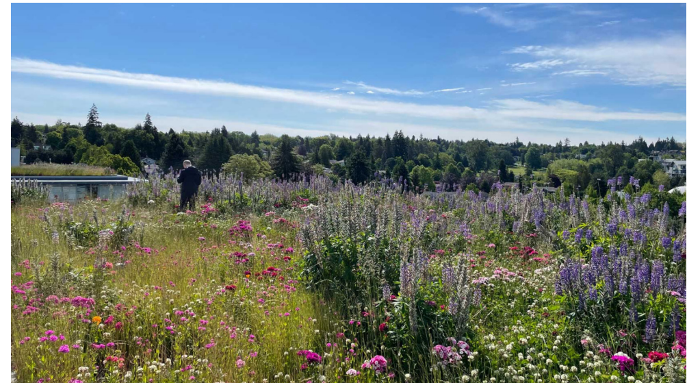
Private Condo Amenity, Vancouver, BC The Architek Group of Companies