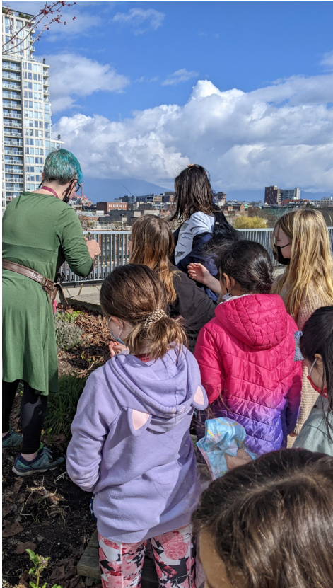
Crosstown Elementary School, Vancouver, BC