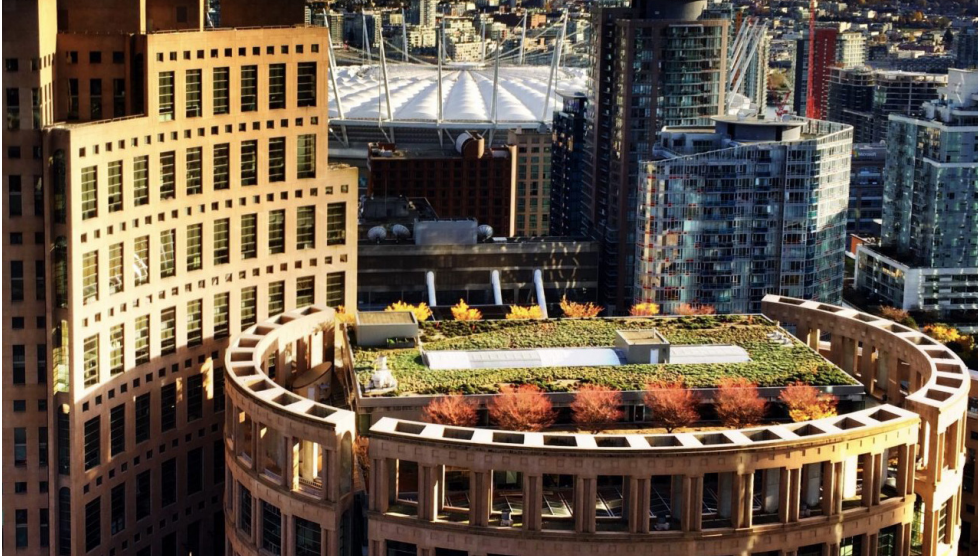
Vancouver Public Library Central Library, Vancouver, BC Vancouver Park Board