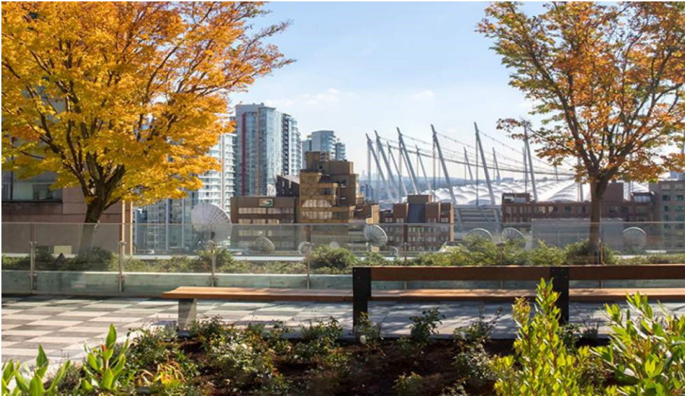
Phillips, Hager and North Garden (VPL Central Library), Vancouver, BC Vancouver Park Board