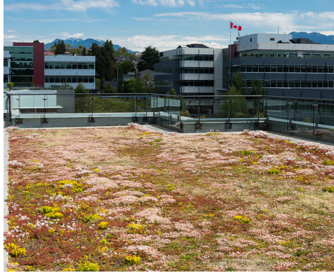
Broadway Tech Centre, Vancouver, BC Next Level Stormwater Management