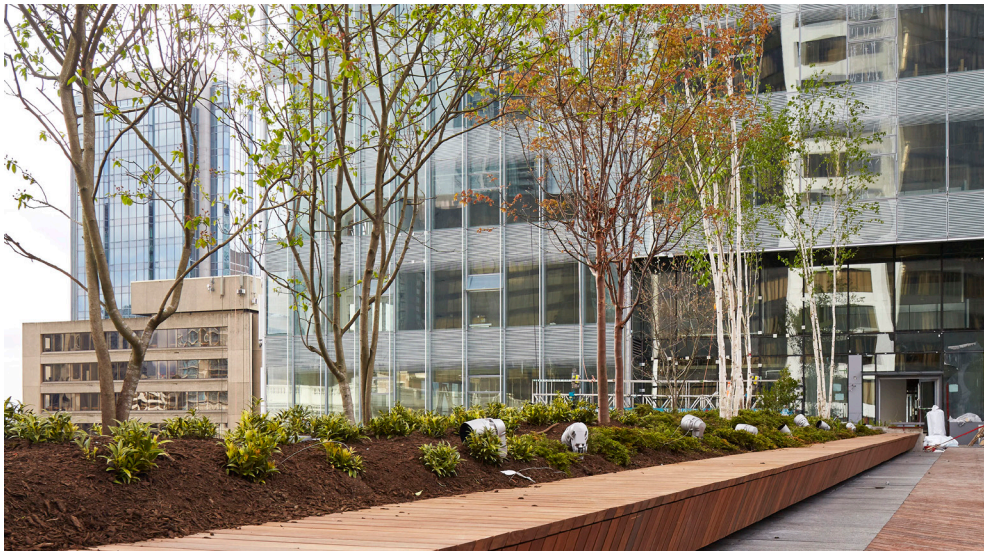
Robert C Austin Centre, Halton Hills, Ontario