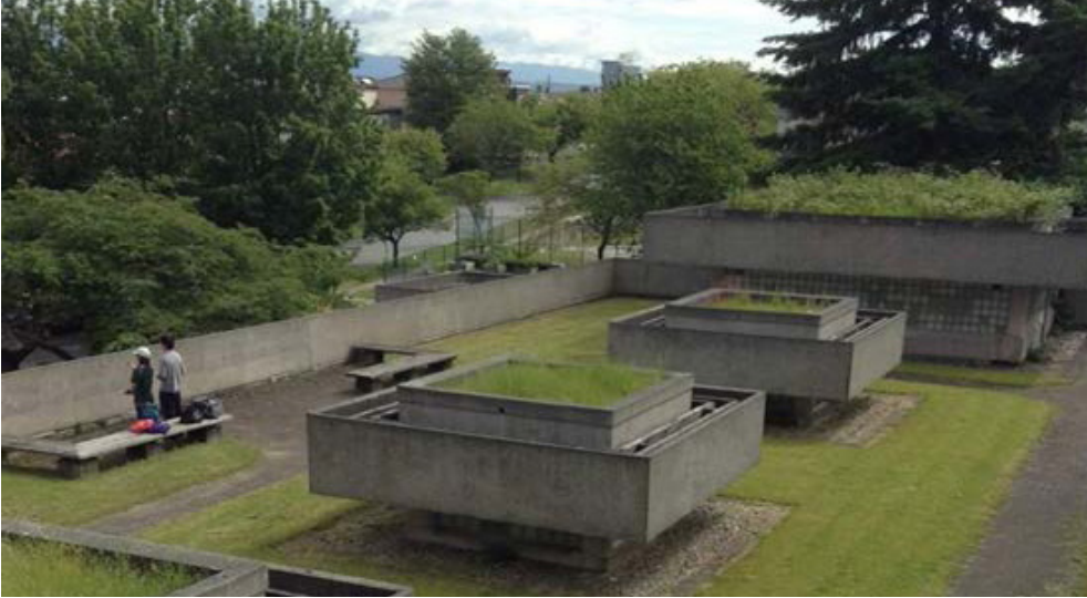
Kensington Community Centre, Vancouver, BC Vancouver Park Board