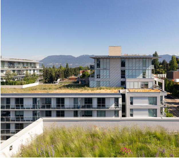
Private Condo Amenity, Vancouver, BC PWL Partnership Landscape Architect Inc.