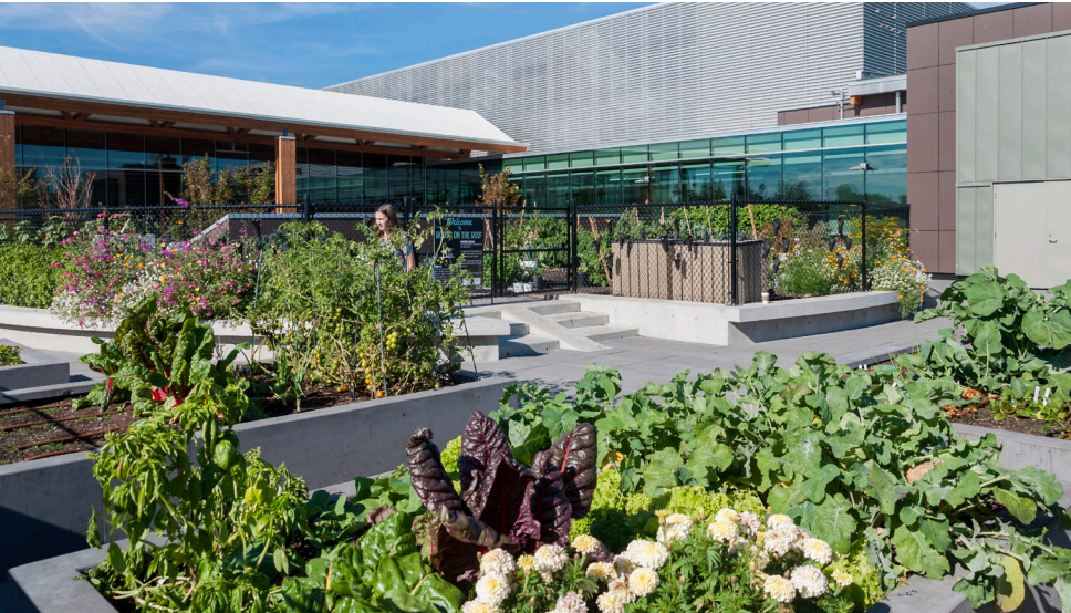
Private Amenity Rooftop Garden, Vancouver, BC

PWL Partnership Landscape Architect Inc.