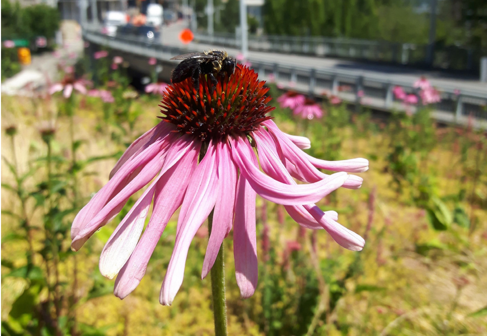
Vancouver House, Vancouver, BC The Architek Group of Companies