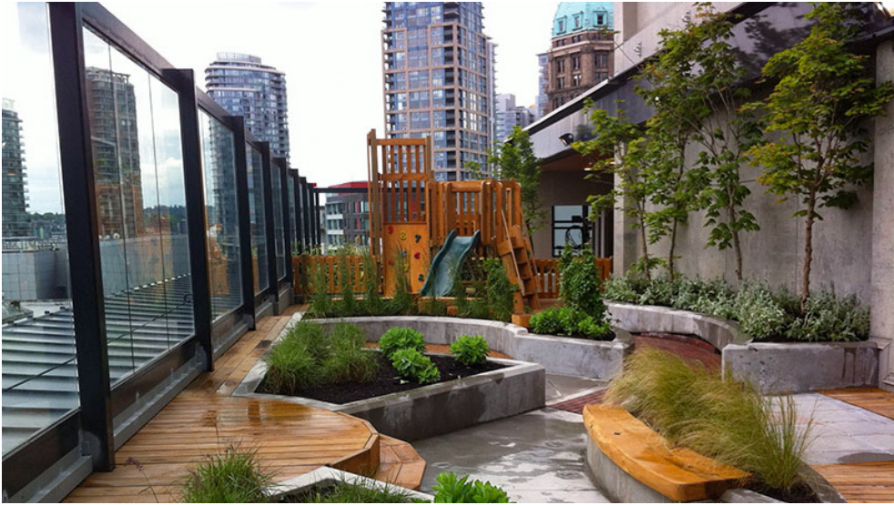
VCC Plaza + Daycare, Vancouver, BC

Henriquez Partners Architects + PFS Studio