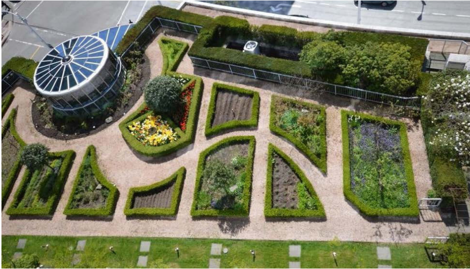
Olympic Village Co-op Rooftop Garden, Vancouver, BC

PWL Partnership Landscape Architect Inc.