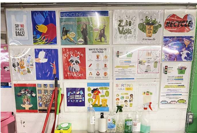
Fun posters above a stainless steel sorting table with hand sanitizer.