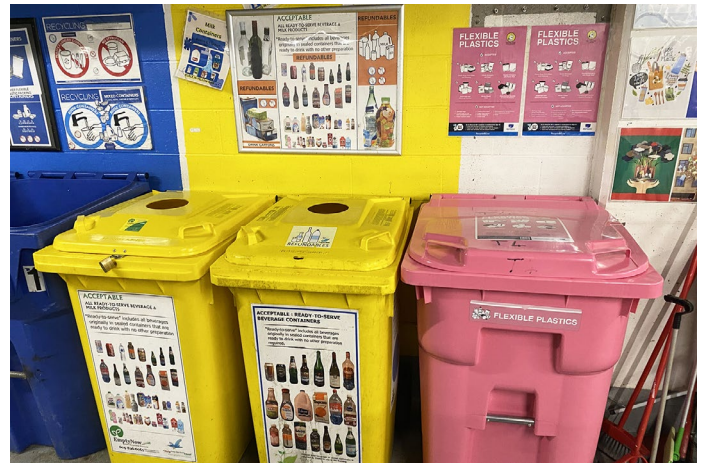
Yellow carts for refundable containers generate revenue for the strata.