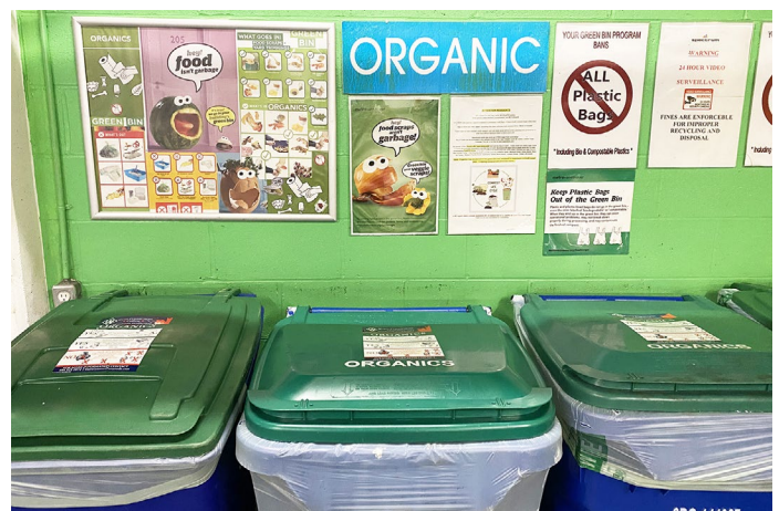
Clear signage shows what food scraps are accepted and banned.