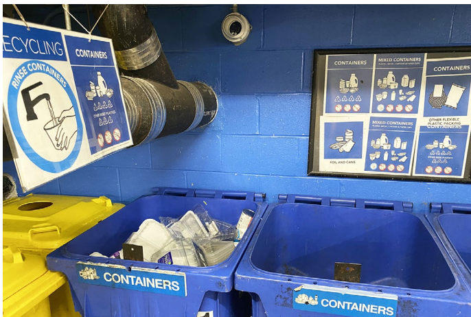
Colour-matched walls and eye-level signage make recycling easy.