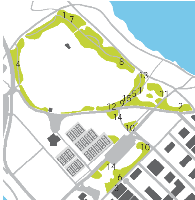
1 Magnolia tripetala

Magnolia tripetala , or umbrella magnolia as it is commonly known, has enormous apple-green leaves that may grow to be up to 60 cm long. It produces large, upright, creamy white flowers in June. These are some of the only fragrancd magnolia flowers, although the scent produced by Magnolia tripetala is quite unpleasant.