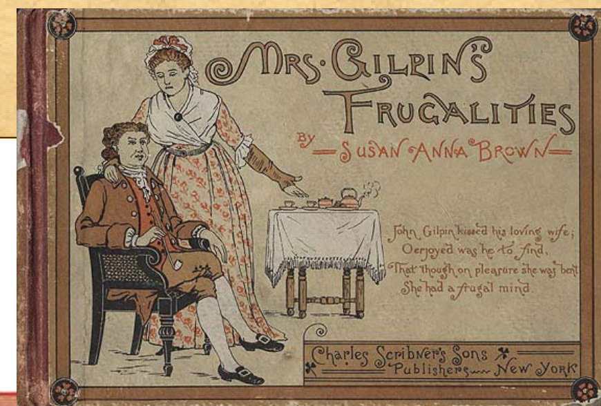
Cookbook cover, 1883

In canning heat pasteurization preserves vegetables in