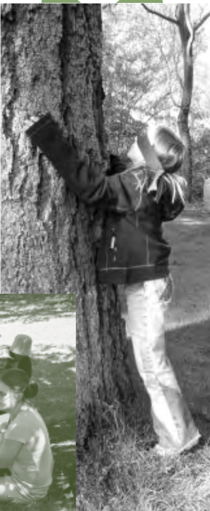
Above: Meeting a tree Top Left: Pond Peering program in action Left: Playing a game called 'Life Cycle' Top right: Examining a moth flower

By participating in nature's magic, children are taught the importance of conservation. Children who have experienced that joy and wonder begin to care about the environment and may be inspired to share their experience with family and friends, or seek further information in books or online. They may join an environmental club; or take part in a school or community garden; or plant a seed in a pot and tend it. No child comes away from a field trip to VanDusen Garden untouched – each takes away special memories.