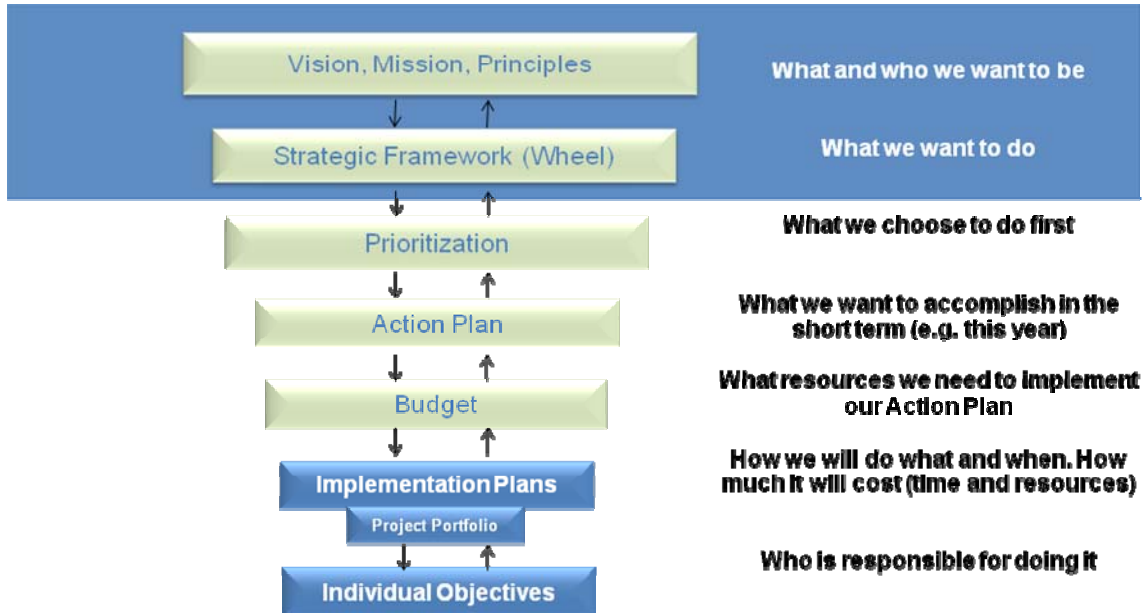
Figure 1 – Cascading Planning Approach

This cascading approach will be implemented in two phases: