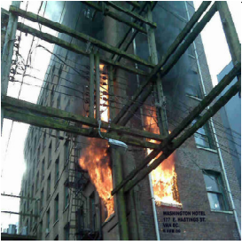
The Washington Hotel in flames in February, 2009.