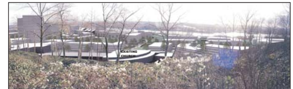
View B: From Everett Crowley Park