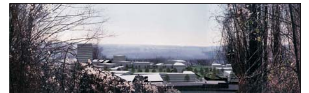
View C: From Everett Crowley Park