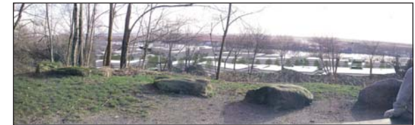
View A: From Everett Crowley Park