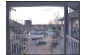
View E: From Champlain Heights