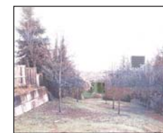
View D: From Champlain Heights