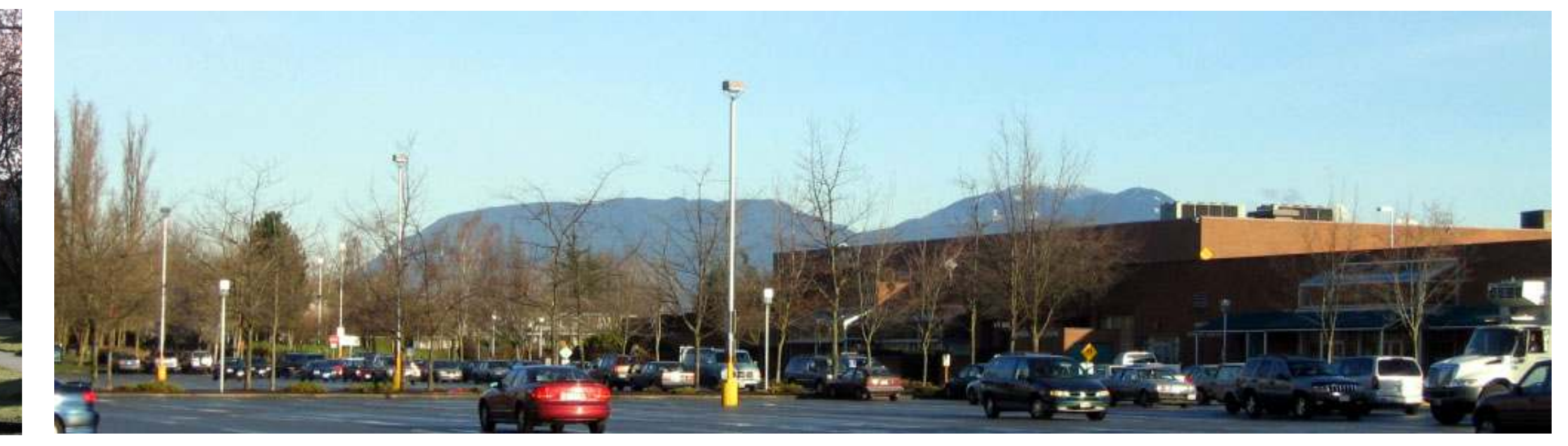
Views around Oakridge Centre