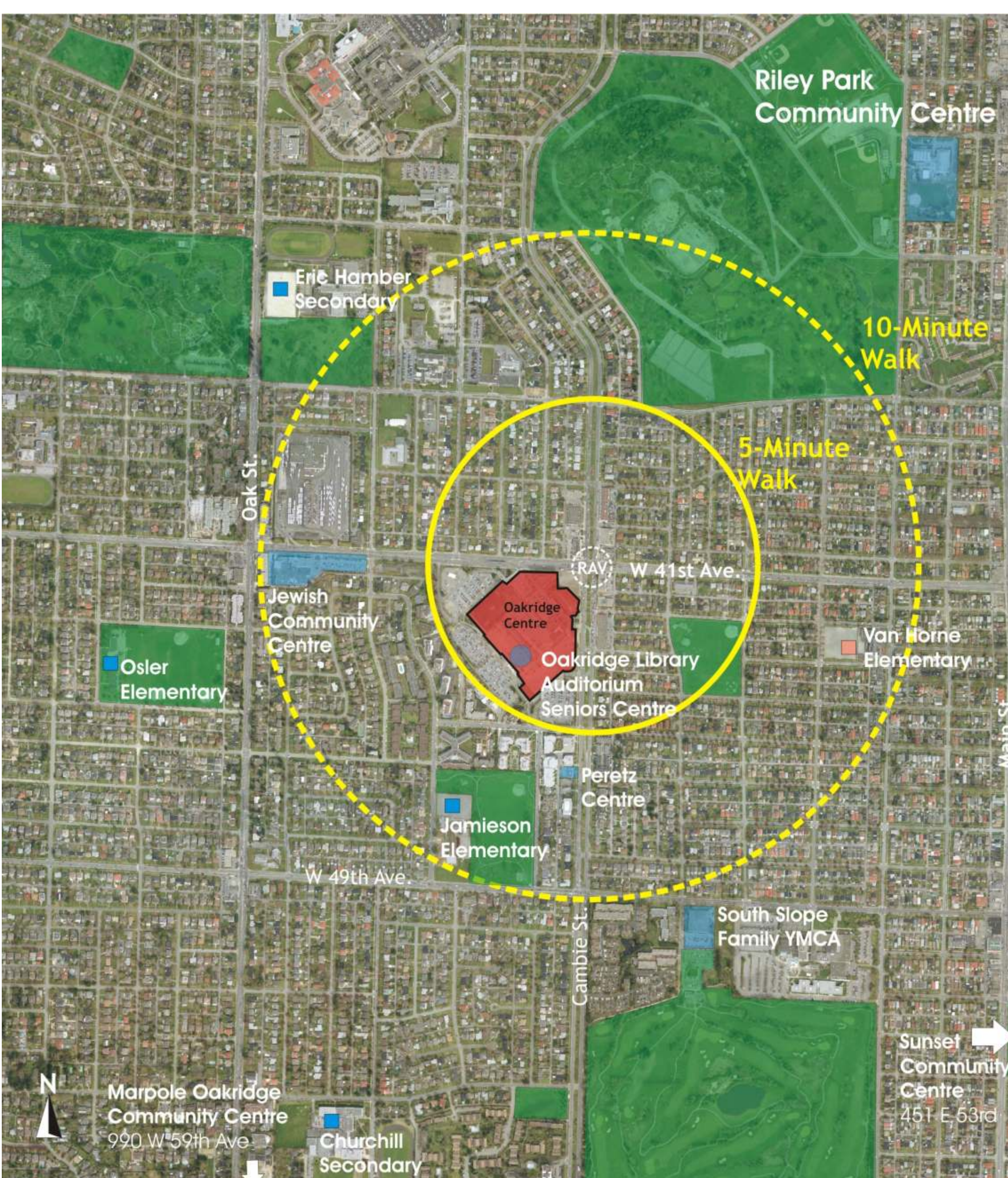
Community Facilities near Oakridge Centre

Future Community Facilities ... Reshaping Oakridge Centre could include new, expanded or relocated community facilities. The Oakridge library is the second busiest branch in the City and seeks some expansion.