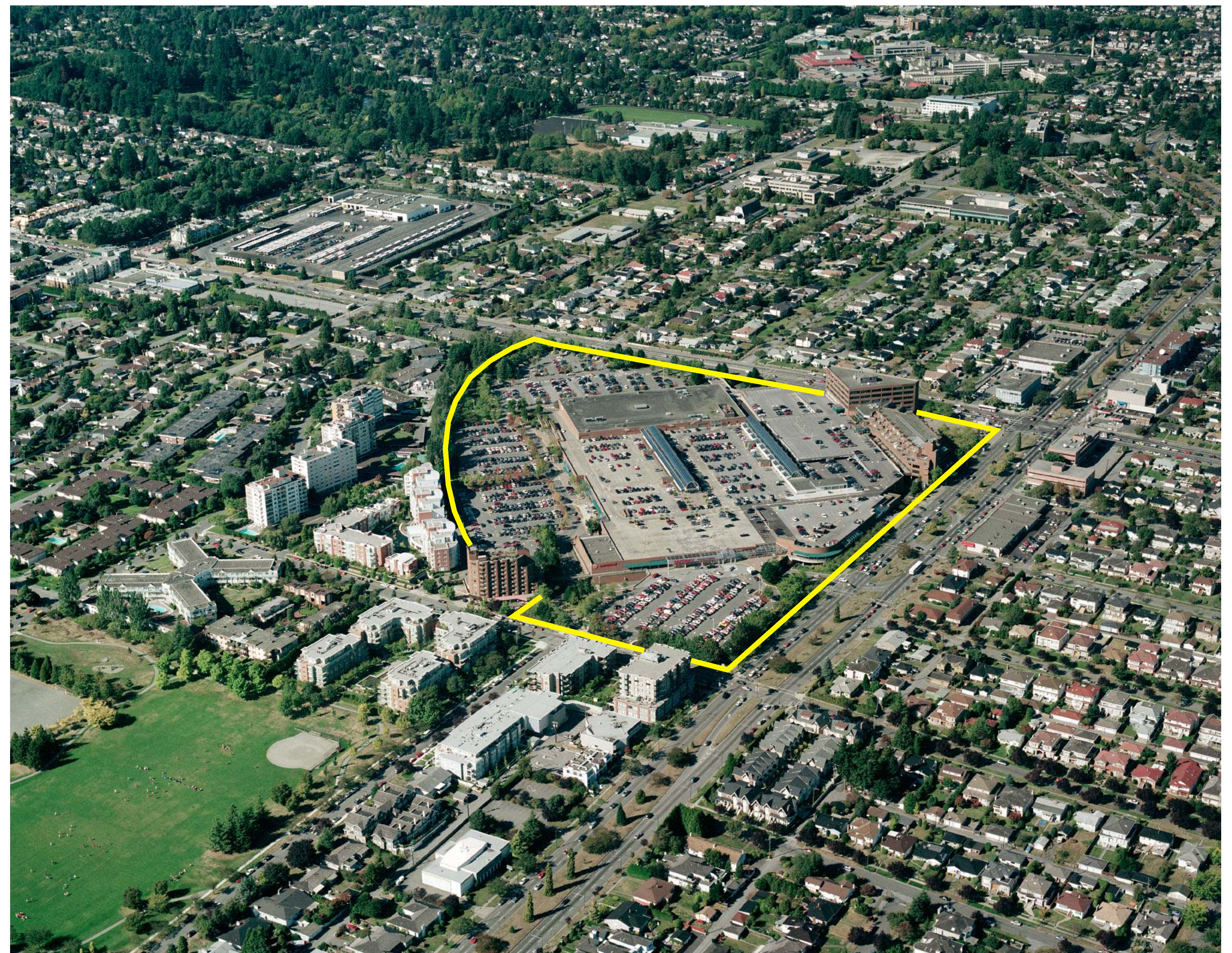
Air photo of Oakridge Centre