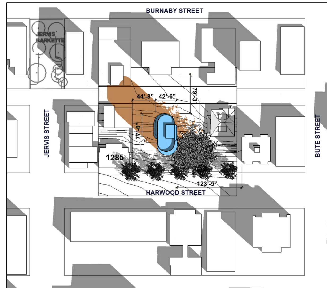
EQUINOX 12PM TOWER SHADES 0% OF COURTYARD