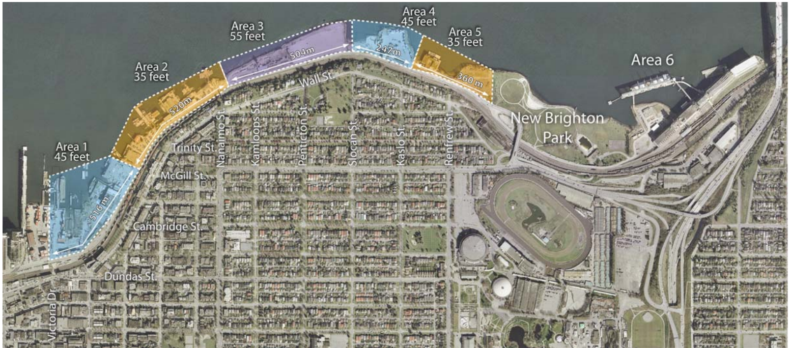
Figure 2. EVPL Area-by-Area Height Guideline Limits

As shown in Figure 3, elevation differences between the escarpment and Port lands vary significantly, impacting opportunities for view preservation. As a result, some loss of water views is possible, with precise impacts depending on both elevation and on-site building location.