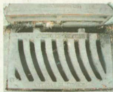
Victoria Foundries storm drain