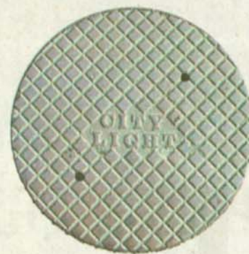
City Light utility cover

Coast Salish artist Susan Point and her daughter Kelly Cannell won $2,000 in Vancouver's Art Underfoot competition with a design depicting four tadpoles and four frogs. Their design will be used on new city storm sewer manhole covers.