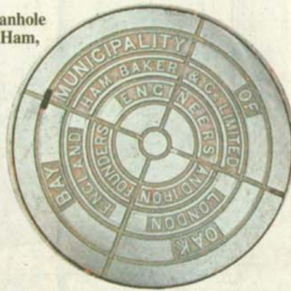
An Oak Bay manhole cover made by Ham, Baker & Co.

This design by Jen Weih, which looks like specks under a microscope, won $2,000 in Vancouver's Art Underfoot competition and will be used on new city sanitary sewer system manhole covers. There were 640 entries in the design contest.