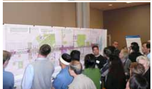
Oakridge Centre Mall, Auditorium June 5, 2010