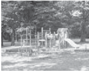
Maple Grove Park: play area

Parks are very important for recreation, beauty, and refreshment. ARKS is fortunate to have a variety of parks and public spaces. These include historic Shaughnessy streetscapes, a number of heritage trees, the King Edward Heritage Boulevard, Ravine Park, VanDusen Gardens, and more conventional parks, playgrounds, and play fields. In total, ARKS has 21 parks (not including VanDusen Gardens due to its city-serving nature), totalling 44 hectares (109 acres) of park. ARKS has 1.1 hectares of 'neighbourhood' park per thousand residents. This is the City standard. School grounds totalling 28 hectares (69 acres) are also important public spaces.