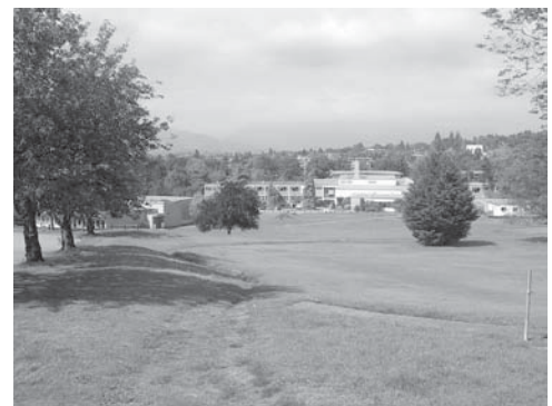
Prince of Wales school grounds