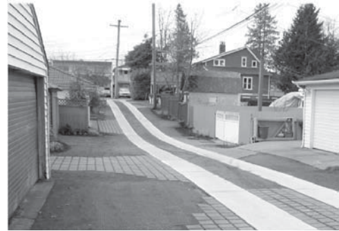
'Country Lane' - an alternative to a paved lane

The country lane design was approved by Council in 2004 as an option for the Local Improvement Program.