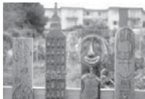
Public art fence