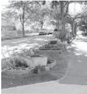
Encourage greening of boulevards