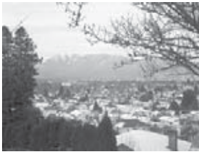
Scenic view from King Edward