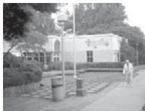
Kerrisdale Seniors' Centre