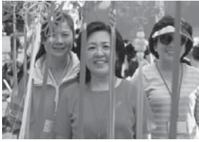
Programs and services for newcomers and immigrants

Comment: This Direction did not receive majority support in the general survey, and did not receive high enough agreement in the random survey to be classified as Approved. It was .3% short of a majority in the general survey, and in both surveys, the Direction received substantially more agree votes than disagree votes (general survey: 2.3 to 1, random survey: 2.0 to 1). As a result, this Direction is classified as Not Approved (Uncertain) and remains on the table for consideration and public discussion in further planning.