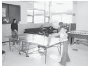
Improve programs and facilities for youth