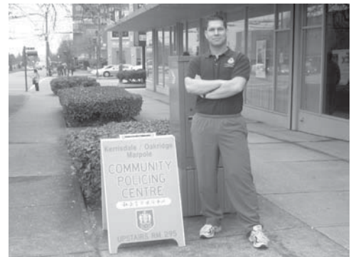
Kerrisdale Oakridge Marpole Community Policing Centre