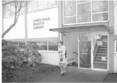
Kerrisdale Branch Library

The Vancouver Public Library operates the Kerrisdale Branch Library at 2121 West 42 nd . It is located in the lower level of the Kerrisdale Community Centre. Established in 1943, it was rebuilt in 1963 and renovated again in 1991 and 2001. Currently the Library Board has no plan to renew or re-locate this library.