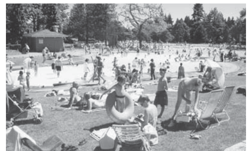
Maple Grove Pool