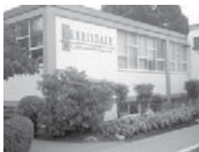
Kerrisdale Community Centre

The term 'Special Needs Residential Facilities' (SNRFs) refers to various types of group housing for people who need some form of support or assistance in their living place. People who benefit from this housing include the frail elderly, people with severe physical disabilities, battered women, children in care, people who have a mental illness, people with developmental delays, people in need of emergency shelter, people under the supervision of Corrections, and the terminally ill. The City's zoning permits SNRFs in all residential zones. Within ARKS there are 8 SNRFs with 454 beds. This represents 9.4% of the SNRF beds in the city, higher than ARKS share of the city's population (7.4%). However, the mix of SNRFs within ARKS is uneven and does not correspond to the City's overall needs. Kerrisdale has no SNRFs, and Arbutus Ridge has two, both serving seniors. Shaughnessy is the only area that has a mix, serving seniors, children and youth, and adults.