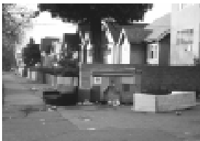
Problem dumping in lane

Vision direction 25.1 would require a zoning change. Further planning and consultation, on issues such as traffic, parking, noise, tax impacts would occur before changes happen. (See Rezoning Policy on page 49)