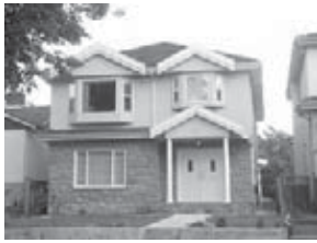
New house example: no design review