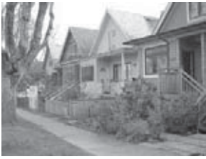
Streetscape of 'character' homes