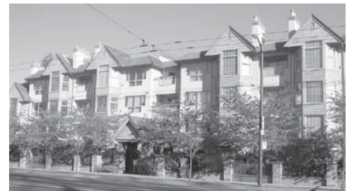
Multi-family housing zoned CD-1: Bloomfield Gardens on Oak