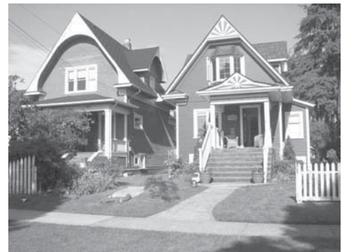
Vancouver Heritage Register houses