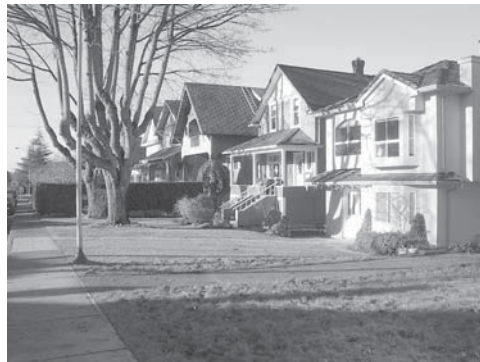
Typical single family streetscape

Residents of RPSC value their single family neighbourhoods. Many were attracted to the area by the combination of housing and neighbourhood which met their needs. Vision participants wanted to maintain the single family character of much of the community.