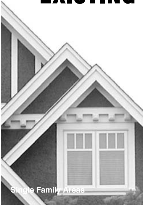
Single Family Areas

Riley Park/South Cambie (RPSC) has a mix of residential neighbourhoods. Most are made up of single family homes, many with secondary suites. North of King Edward and east of Ontario, there are many heritage and character homes. Elsewhere, the homes are mainly from the post-war period giving these neighbourhoods their own distinctive flavour. Higher density townhouses and four storey apartments line many of the major streets, especially north of King Edward. Apartments above stores are starting to be developed in commercial areas along Oak, Cambie, Main, and Fraser.