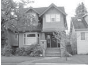
New house example: full design review