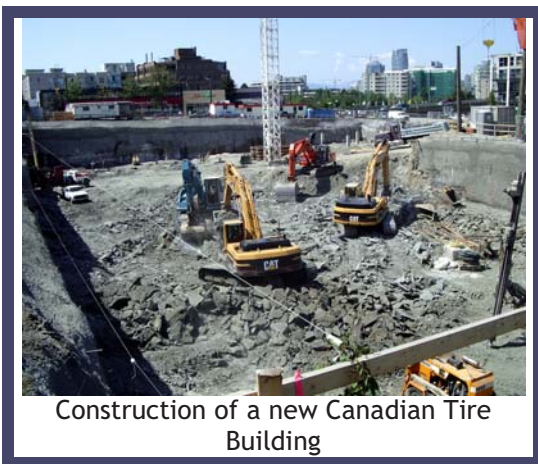
Construction of a new Canadian Tire Building