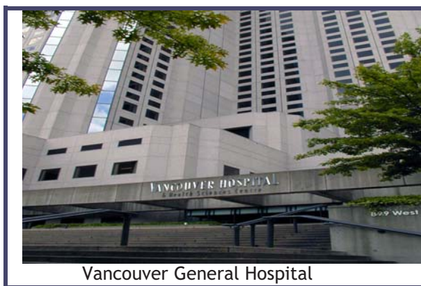
Vancouver General Hospital

In 2001, nearly 20,000 people were employed in this sector in the Metro Core. This is 10% of all Metro Core employees. The majority of Metro Core employment in this sector is in hospitals (Table 1).