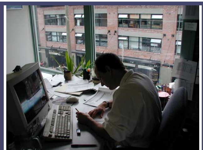
A Professional at Work in Yaletown

This high share applies generally to all sub-sectors, except scientific research and development services (Table 3).