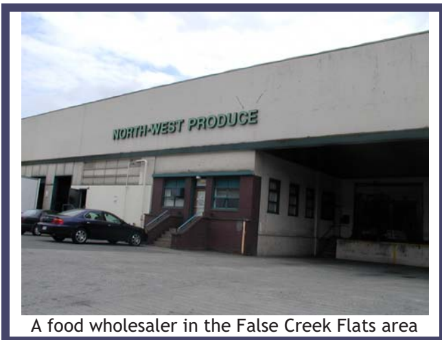
A food wholesaler in the False Creek Flats area

In 2001, over 6,300 people were employed in the wholesale trade sector in the Metro Core. This is 3% of all Metro Core employees. One quarter of Metro Core employment in this sector is in food, beverage, and tobacco wholesale distribution (Table 1).