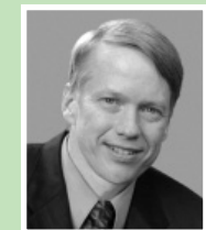
Mayor Sam Sullivan

"It's time. On behalf of your City Council I am pleased that the Mount Pleasant Community Planning Program is underway. It's an excellent opportunity for the community to work with the City on a new plan. Your input and involvement is critically important. Take the time to attend one of the Community Plan Fairs, participate in a community workshop, or join the Mount Pleasant Community Liaison Group. You can make a difference."