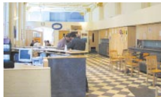
Health Contact Centre at 166 E. Hastings St.

The program includes home visits and partnerships with emergency shelters to extend options to homeless people throughout the region. Home/outreach programs are a responsive and cost effective way to provide withdrawal services. Like ambulatory detox, this service focuses more on detox as a process than a place.