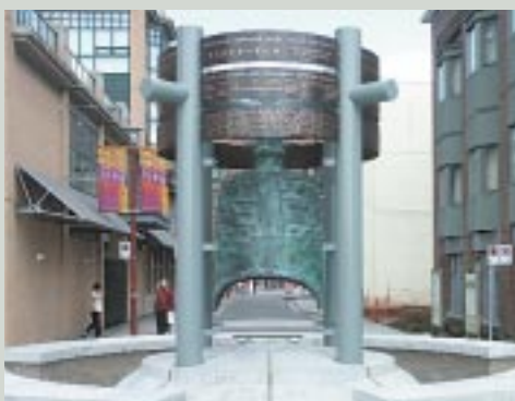
Guangzhou bell in Shanghai Alley

A walkway between the Vancouver Public Library and Chinatown has been named the 'Silk Road', after the route across Asia that linked Rome to China. The first phase marked the route with banners and signage. In the next phase story-telling panels will be installed along the route.