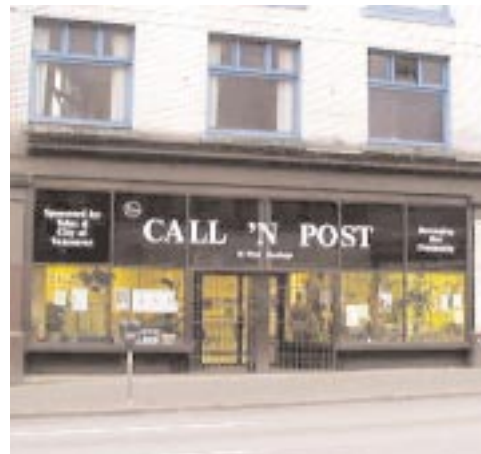
Call and Post at 16 W. Hastings

low-income DTES residents, Vancouver Police, EasyPark, ICBC and SecuriGuard, the project aims for self-sufficiency.