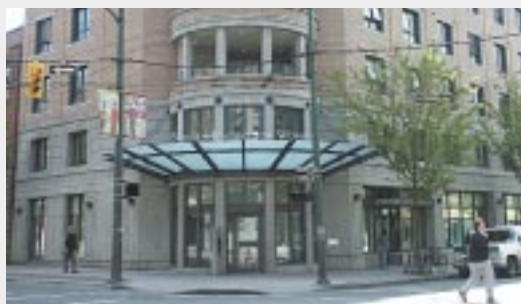
Bridge Housing at 103 E. Cordova St.