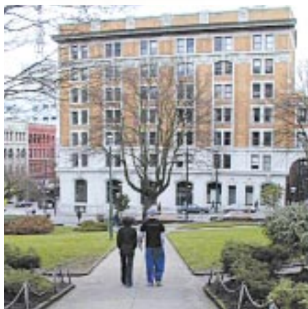
Victory Square Park

Making parks, sidewalks, lanes and streets more appealing can have a big impact on a community, and the DTES is no exception. With VA support, new lighting in Victory Square Park was installed in spring 2002 to improve safety and usability of the park while celebrating its history. New lights in Chinatown add heritage value and make the area more attractive for evening shoppers. Mosaic tiles installed in sidewalks now form the Historical Markers walking tour through the Downtown Eastside, Chinatown, and Strathcona. The 17 mosaics, along with banners and a guidebook, depict local history, places, and people. Designed by local artists and created by residents, these mosaics are part of a life skills training and community pride project managed by the Carnegie Centre.