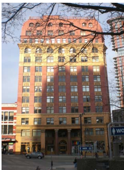
2. Dominion - 207 W Hastings St. Height: 170' (14 storeys) Use: Commercial Adjacent Max. Height: 70'-100'