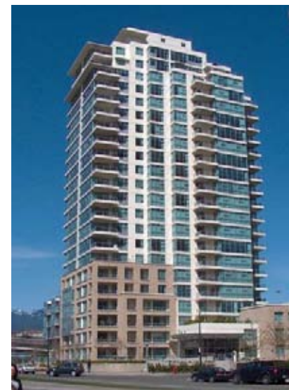
6. City Gate - 125 Milross Ave. Height: 200' (22 storeys) Use: Residential Adjacent Max. Height: 75'