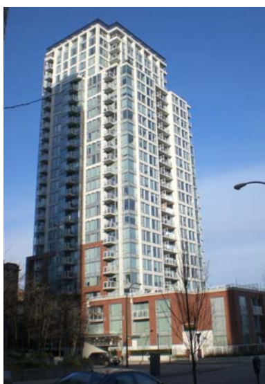
4. Taylor Building - 550 Taylor St. Height: 230' (26 storeys) Use: Residential Adjacent Max. Height: 50'-65'