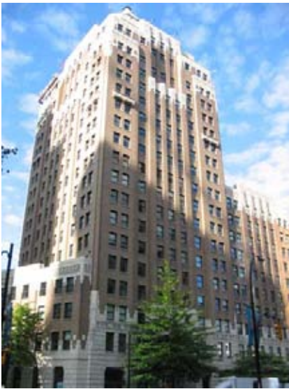
1. Marine Building - 355 Burrard St. Height: 320' (21 storeys) Use: Commercial Adjacent Max. Height: 450'