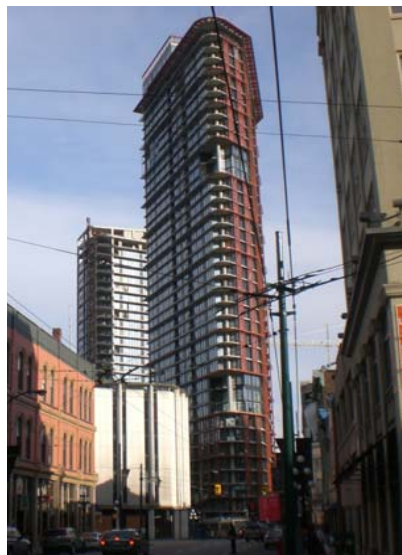
5. Woodward's - 100 Block W Hastings St. Height: Abbott Tower 400' (40 storeys); Cordova Tower 315' (31 storeys) Use: Residential, Commercial, Institutional Adjacent Max. Height: 70'-100'