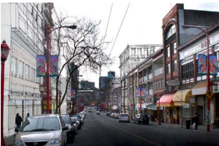
Option 2. Moderate Increase (Up to 75')