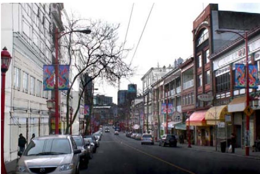
Option 1. Current Maximums (Up to 65')