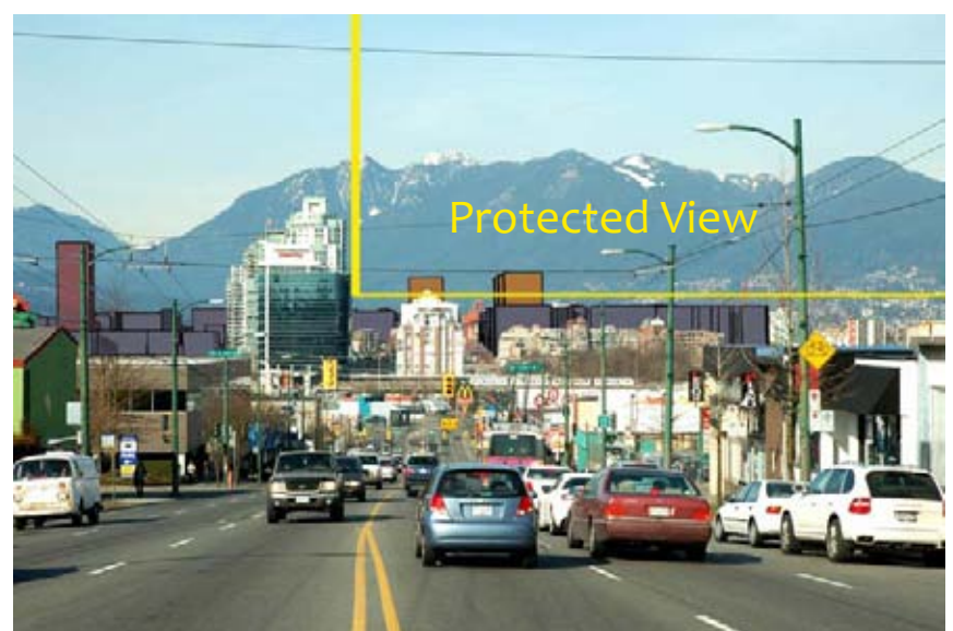
Impact of Main Street Corridor Special Sites (up to 200') with Option 2 General Height