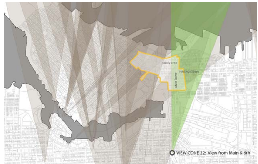
View Corridors in the Historic Area

The map to the right illustrates the Main Street view cone, and the images below show the impact that Special Sites would have on this view.