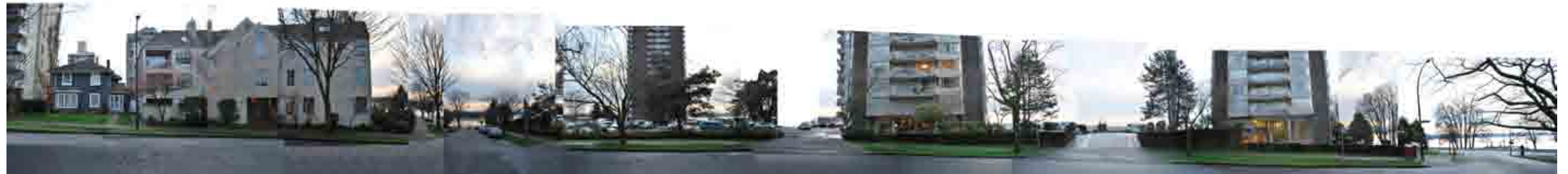
HARWOOD STREETScape LOOKING WEST