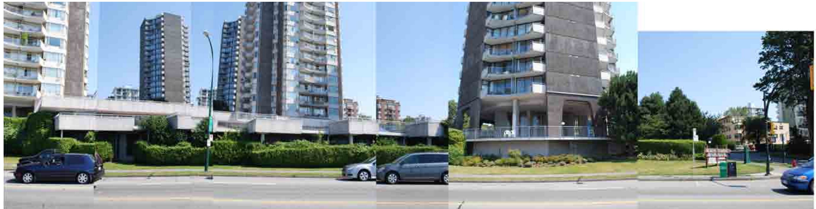
BEACH AVENUE STREETSCAPE LOOKING EAST