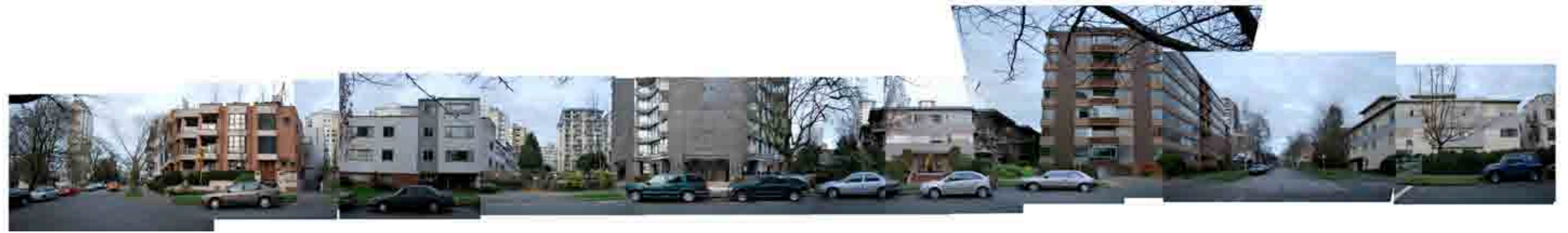
HARWOOD STREETScape LOOKING EAST