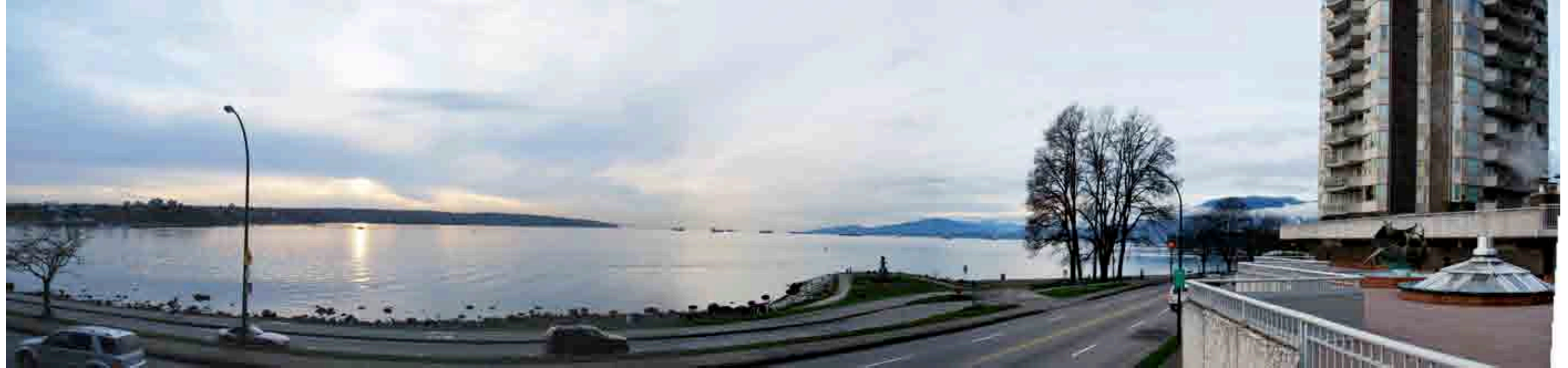
BEACH AVENUE STREETSCAPE LOOKING WEST