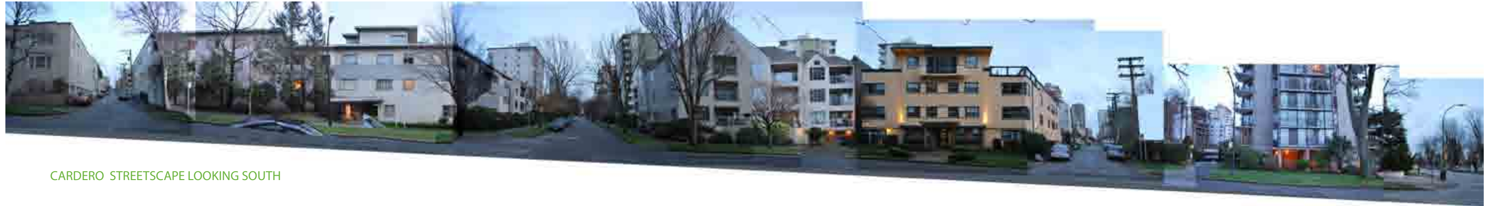
CARDERO STREETScape LOOKING SOUTH