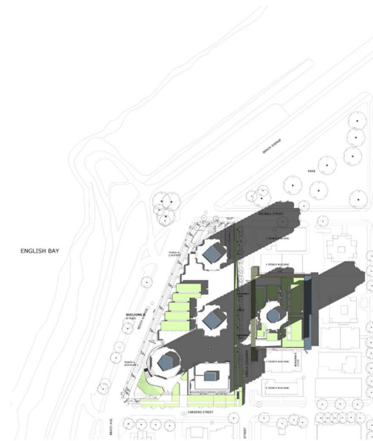
SPRING EQUINOX 14 PM