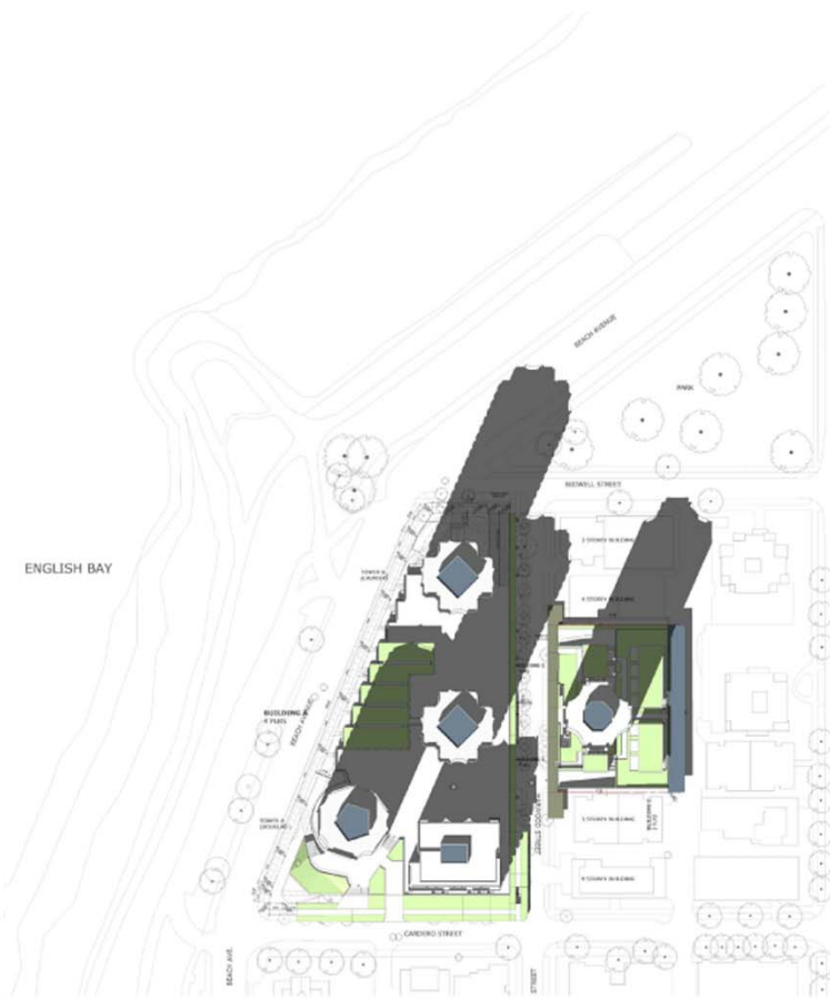
SPRING EQUINOX 12 PM