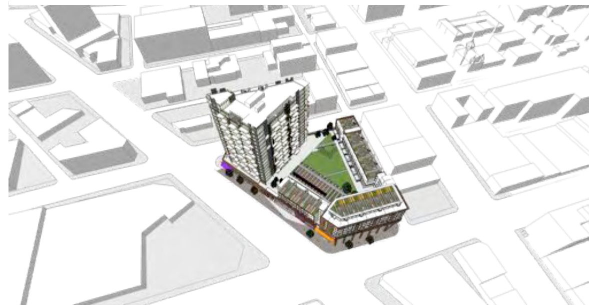
11 Kingsway, Broadway and Main Street