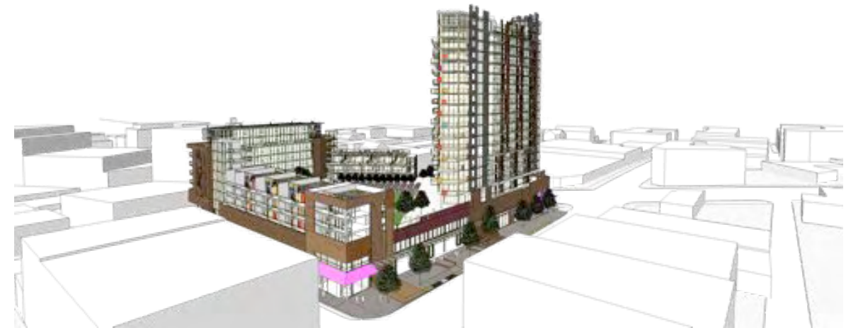
13 Watson Street and Tenth Avenue