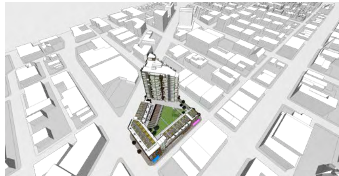
10 Kingsway and Broadway