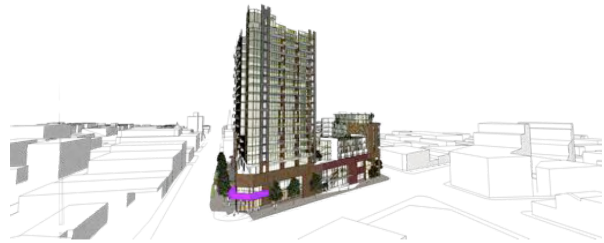
12 Kingsway and Tenth Avenue